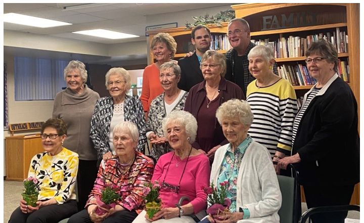
At the Women's Salad Supper on May 9, these ladies (80+) were recognized.