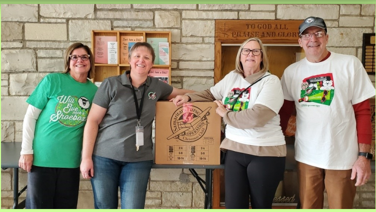
The very first carton that was filled during collection week.

We collected 1,270 shoe boxes that were packed from community members, Our Savior members, groups and area churches! Thanks to Renae, Anne and all the volunteers. We look forward to participating in collection week again next year!