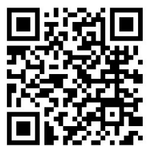
TreeHouse Plant Sale

Scan the QR Code to place your order online. The sale is open through April 7 . Plants can be picked up May 15 in Eagan.